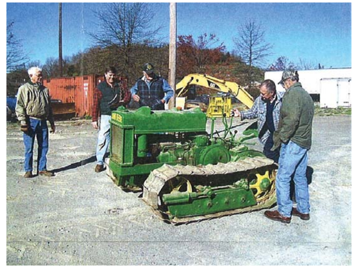
Bruce is giving shifting instructions