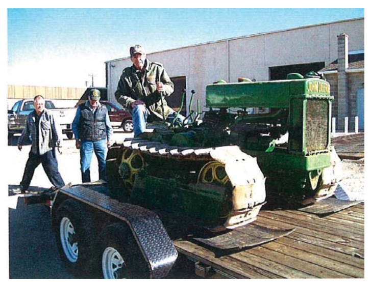
Loading for the ride to our engine shed