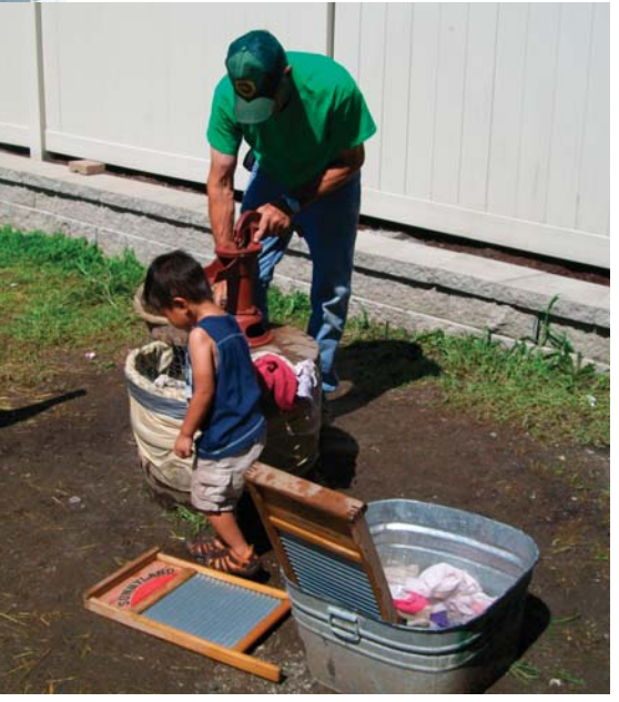
Blace is recruiting a new apprentice