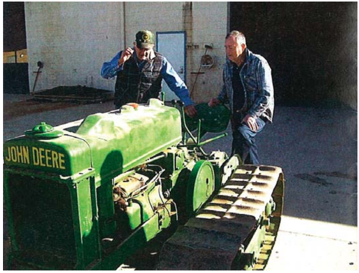
Blace and Bruce discussing the warranty