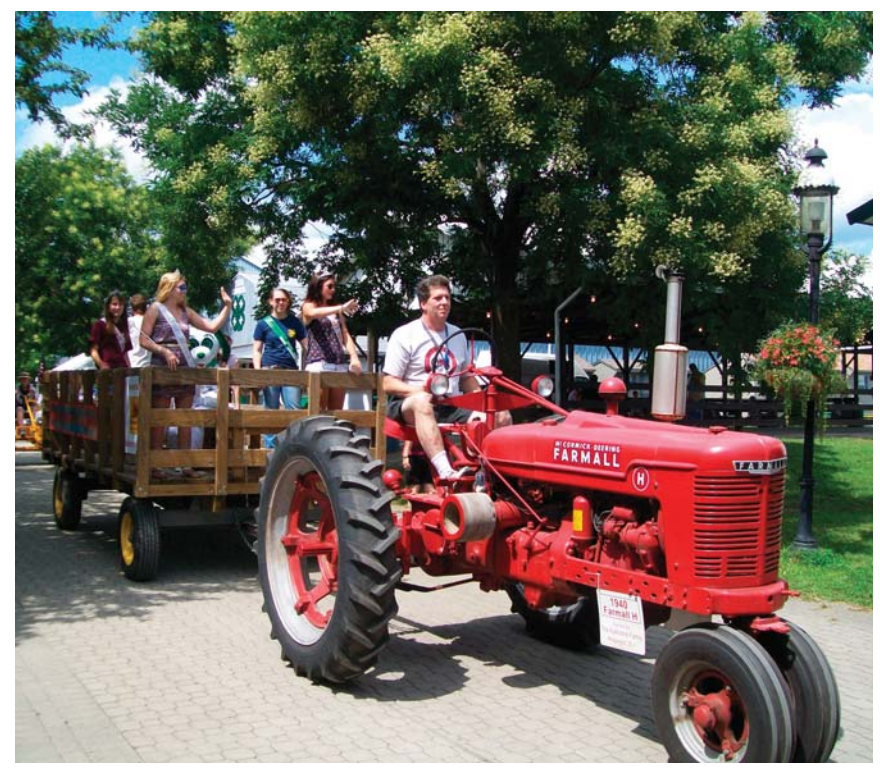
Tractor parade at the fair

Saturday, September 8th at G & H in Newton 9:00 AM - 3:00 PM